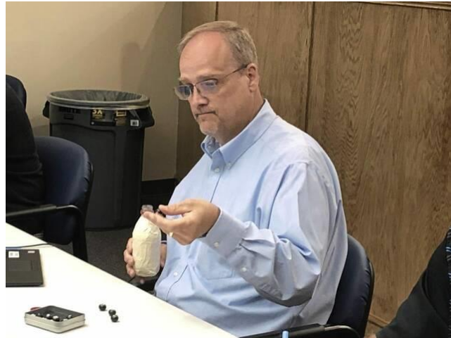
2Westmoreland officials draw lottery balls from bottle

Because Pennsylvania elects rather than hires poll workers, margins in low-turnout races make tiebreakers relatively common. In Westmoreland County, hundreds of races were called in 2021 and 2022 using bingo balls loaded into a Dr. Pepper bottle covered in masking tape. v