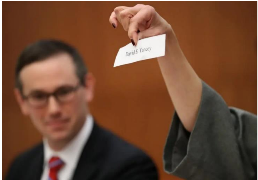
Virginia State Board of Elections draws the lucky winner

Depending on local laws, officials sometimes have to break ties, and this happens more than you knew. To better underscore the importance of clean processes resting on a foundation of accurate voter registration rolls, PILF has built a running repository of deadlocked and close election results ( \leq 30 ) across the United States.